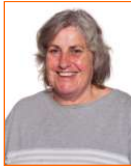
Prue Satchwell Visual Arts Resources