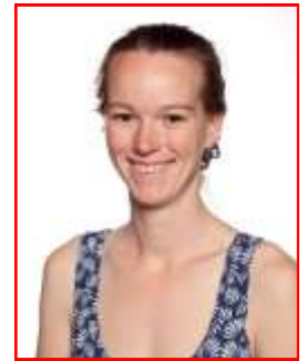
Kerry Ford Visual Arts & Performing Arts