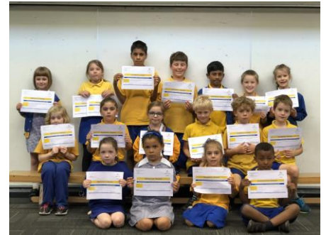
Student Achievement Award winners

EdConnect Australia is an organisation that connects older retired volunteers with young people in schools who may need additional support; either academic or social. EdConnect already has a Learning Support program operating in our school with a number of volunteers and a new Mentoring program has just begun. If you are interested in volunteering in local schools, go to www.edconnectaustralia.org.au or contact 1800668550. Email edconnect@edconnect.org.au