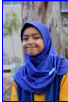
Aisha Junior School Council Grade 5/6