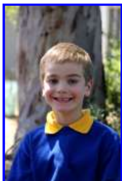
Archer Junior School Council Prep