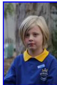
William Junior School Council Grade 1/2