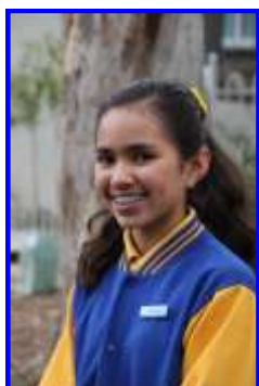
Valeria Junior School Council President