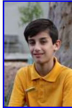
Fera Yellow House Captain