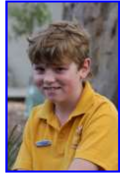
Henry Junior School Council Grade 5/6