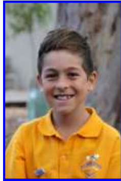
Anthony Junior School Council Grade 3/4