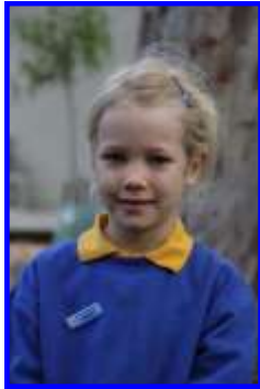
Florence Junior School Council Vice Grade 3/4