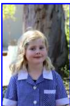
Eidie Junior School Council Prep